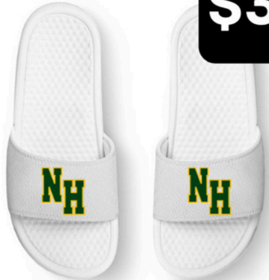
Pride Slides- White