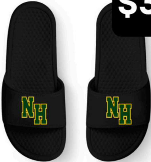
Pride Slides- Black